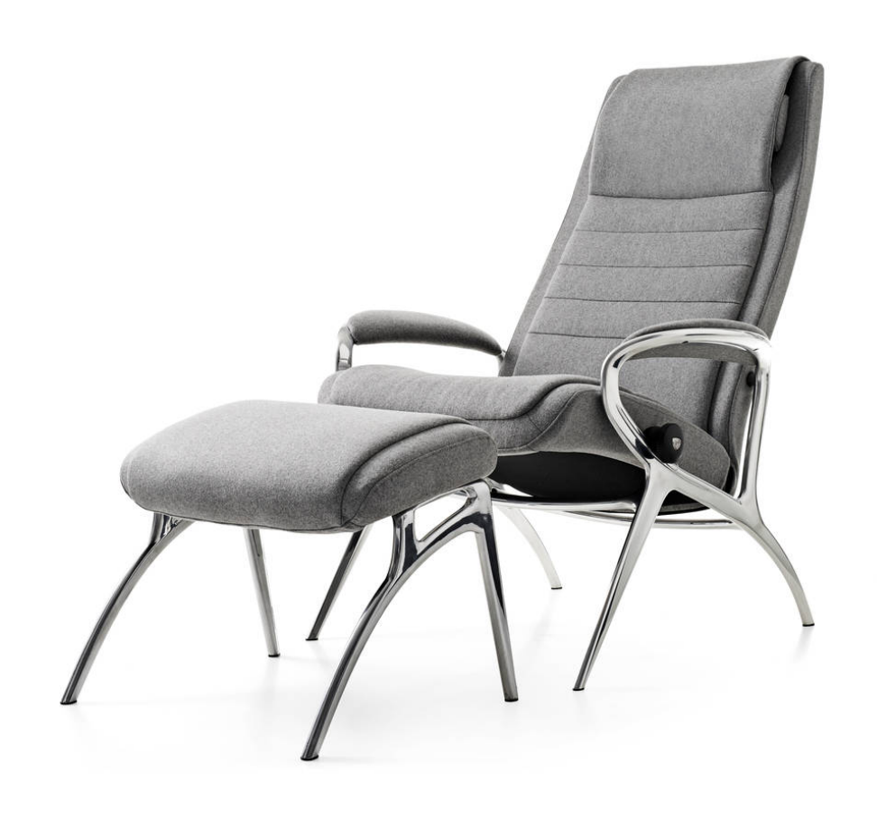
Stressless® YOU John aluminum