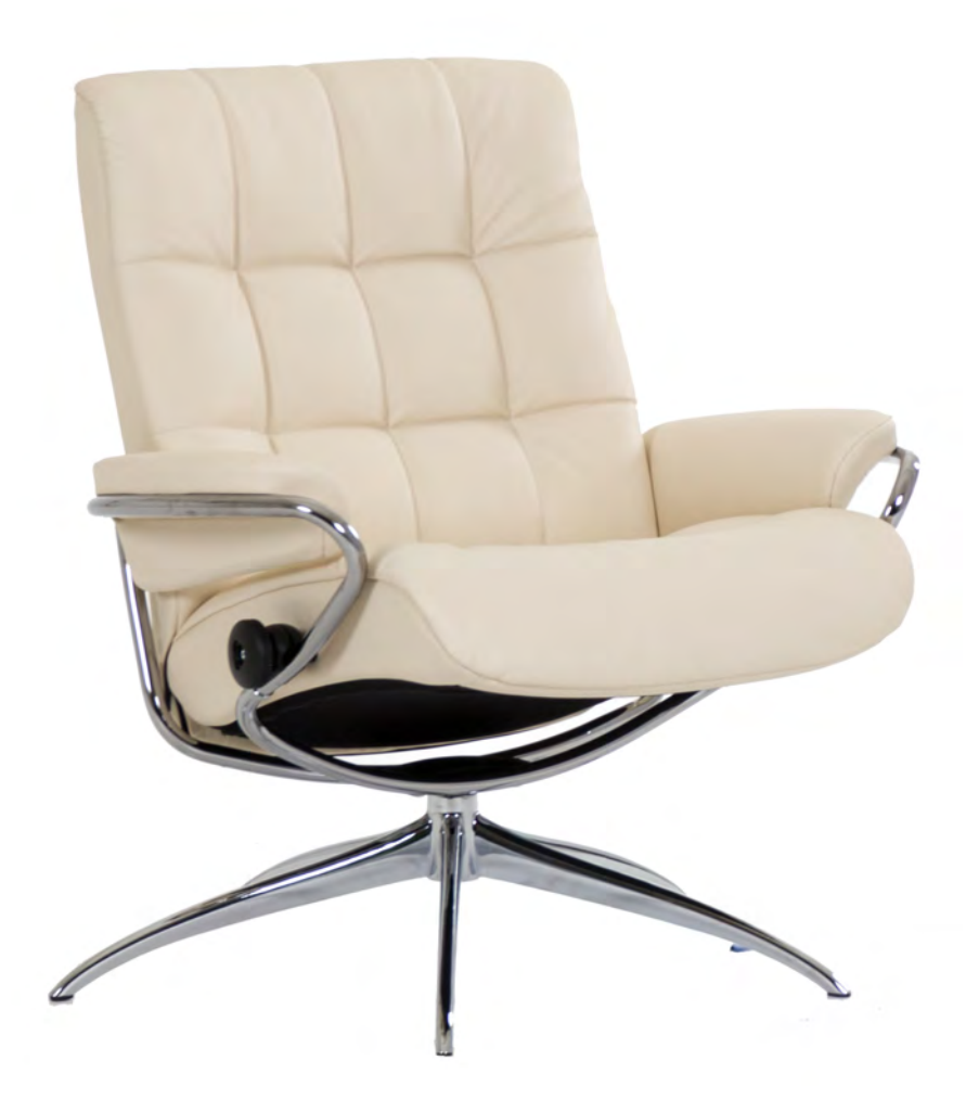
Stressless London Low Back