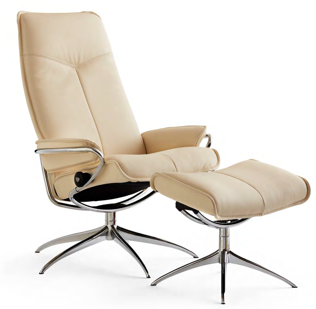
Stressless City High Back