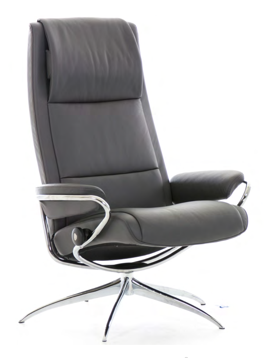
Stressless®Paris High Back