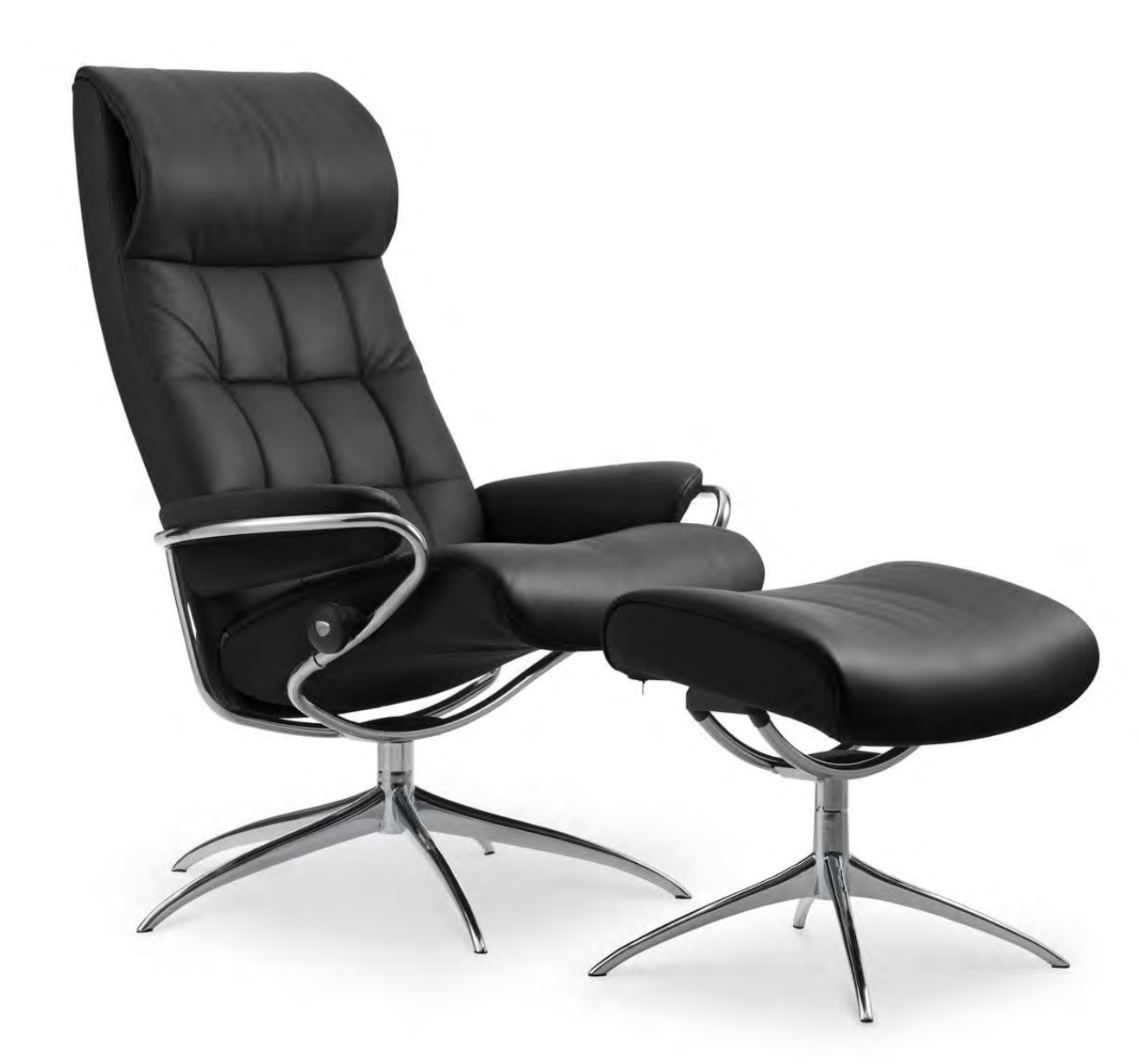
Stressless®London High Back