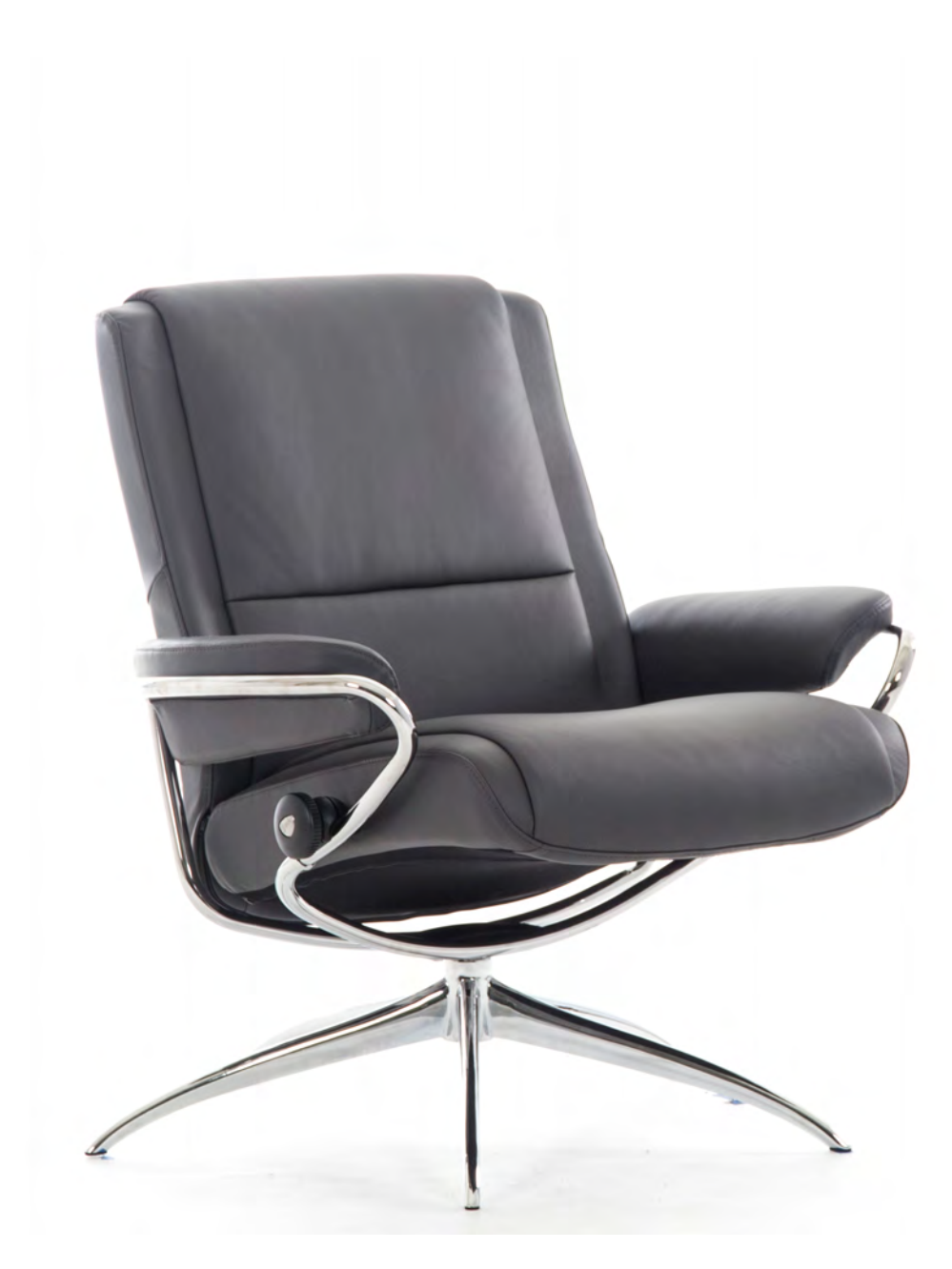
Stressless®Paris Low Back