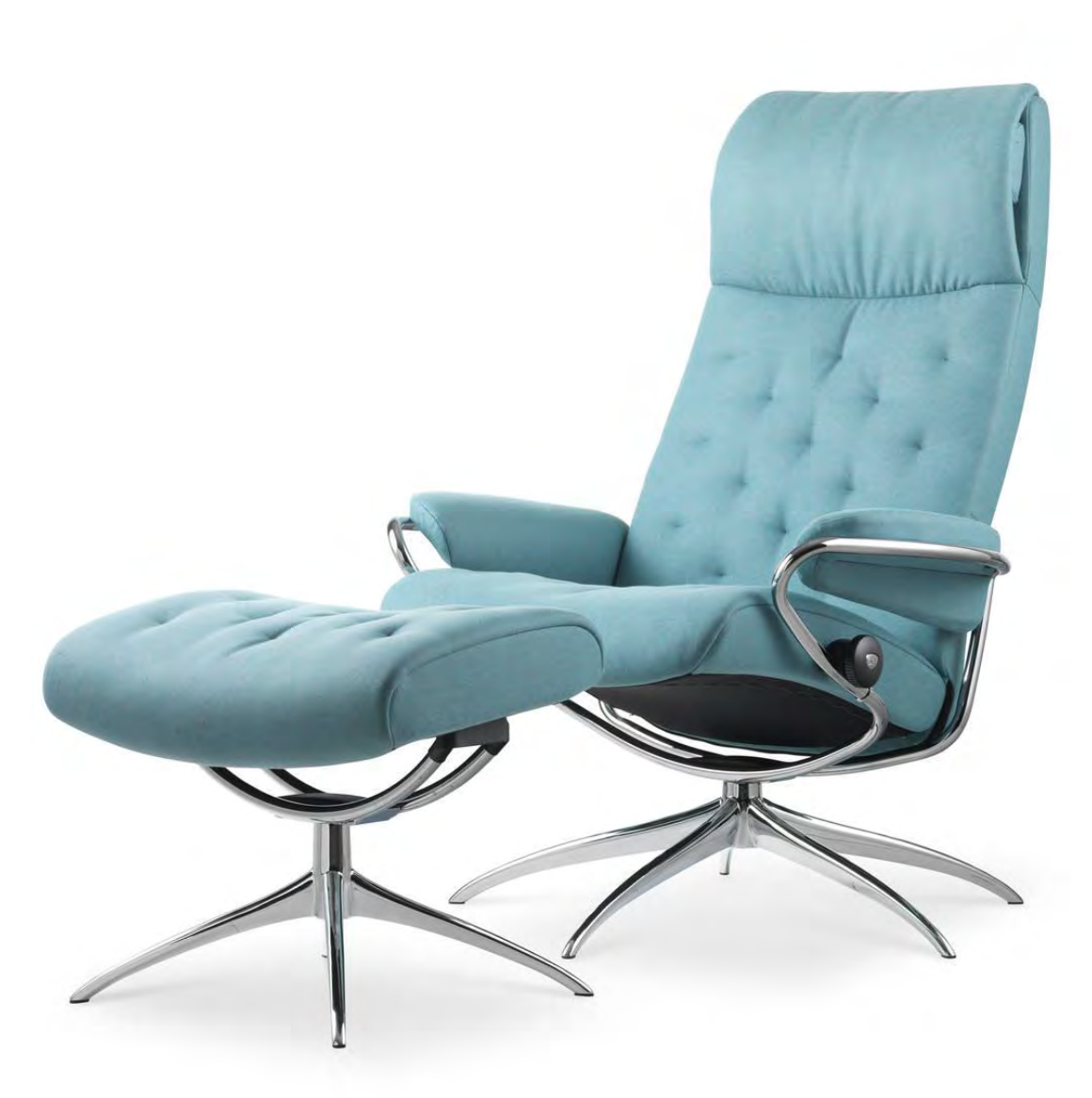
Stressless®Metro High Back