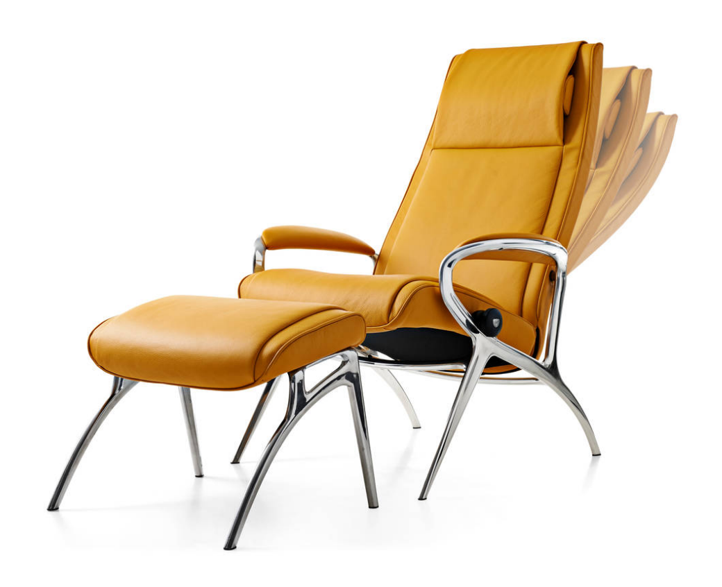
Stressless *YOU James aluminum