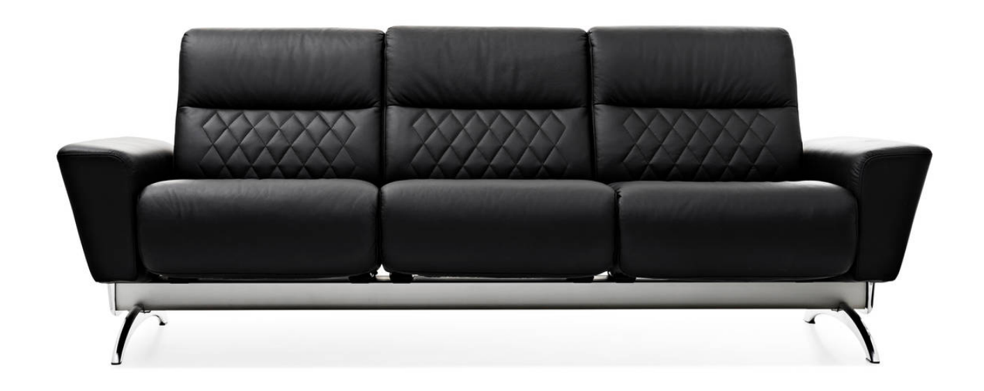
Stressless® YOU Michelle three-seater