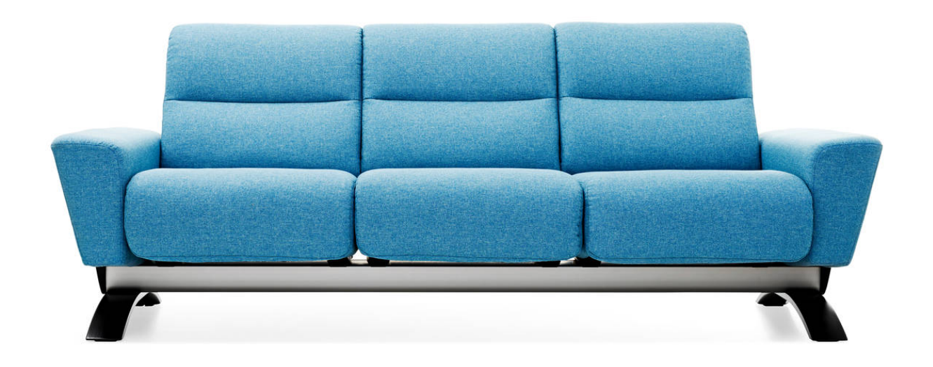
Stressless® YOU Julia three-seater