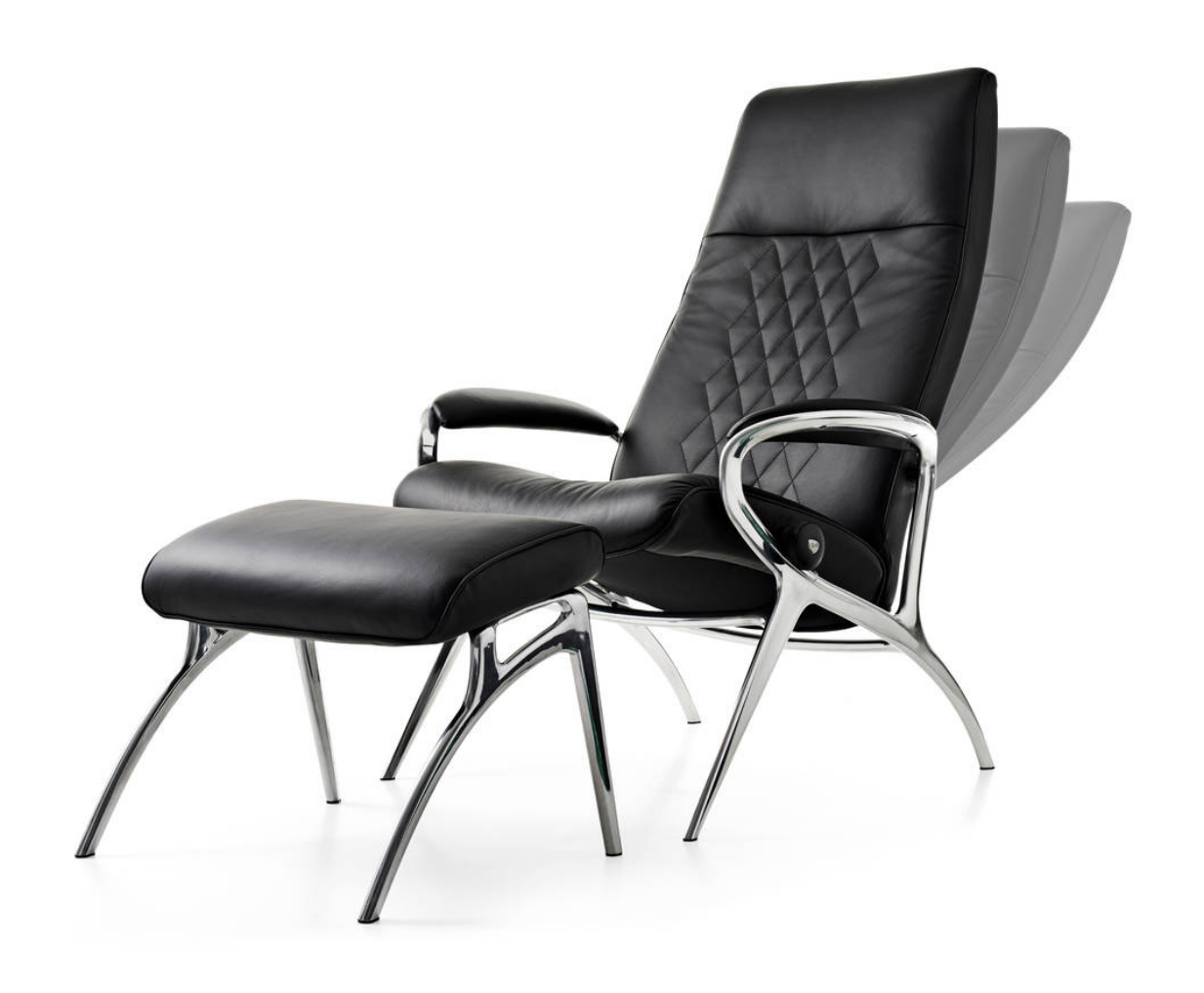
Stressless® YOU Michael aluminium