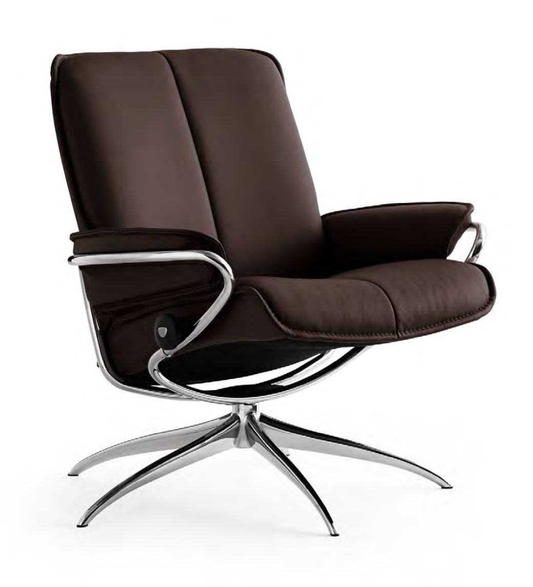
Stressless®City Low Back