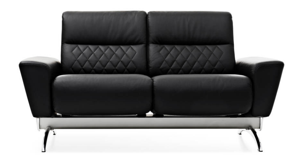
Stressless® YOU Michelle two-seater