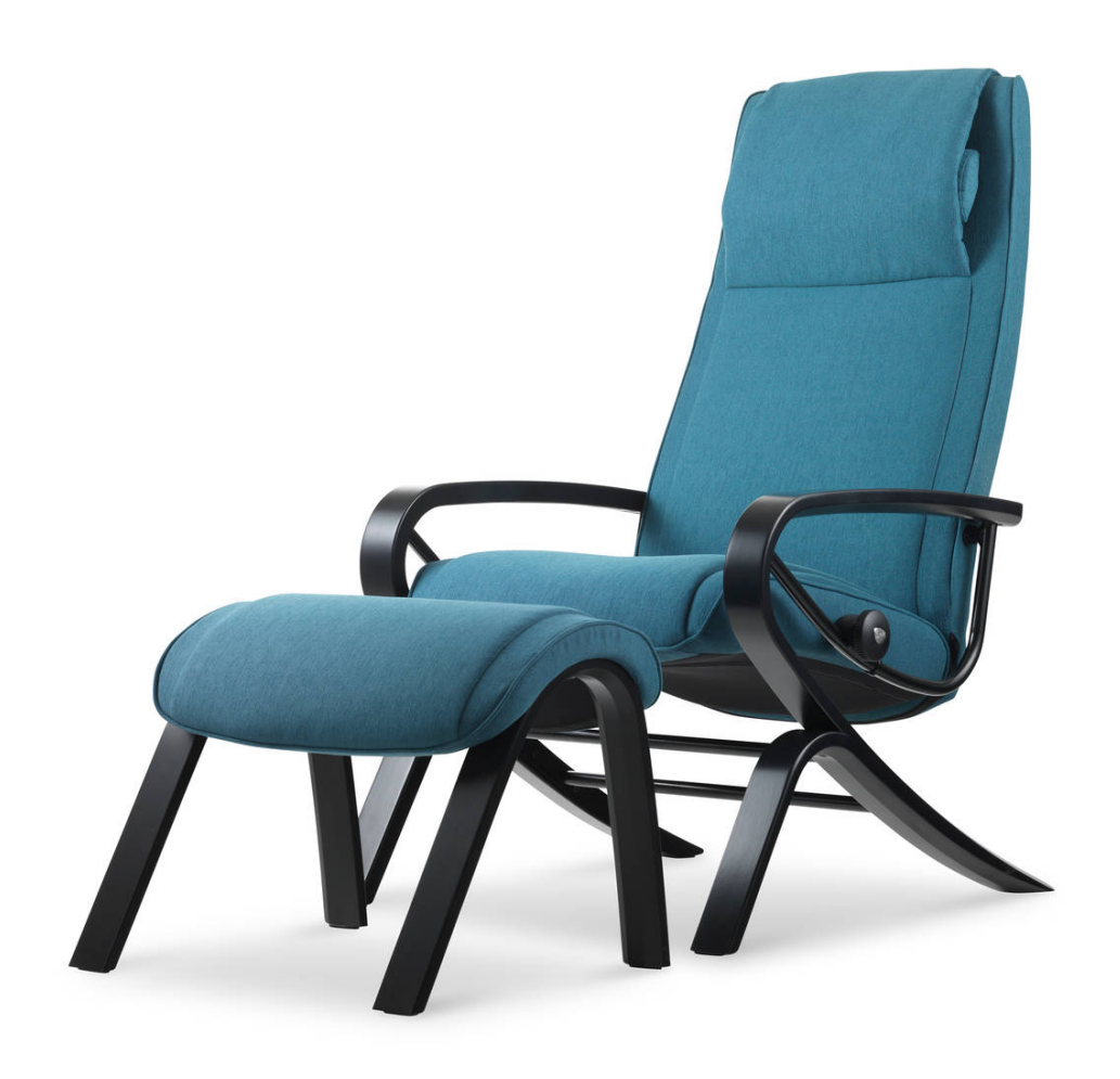
Stressless® YOU James wood