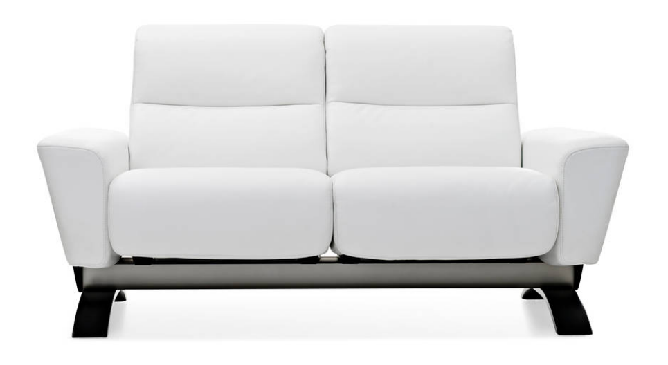
Stressless®YOU Julia two-seater