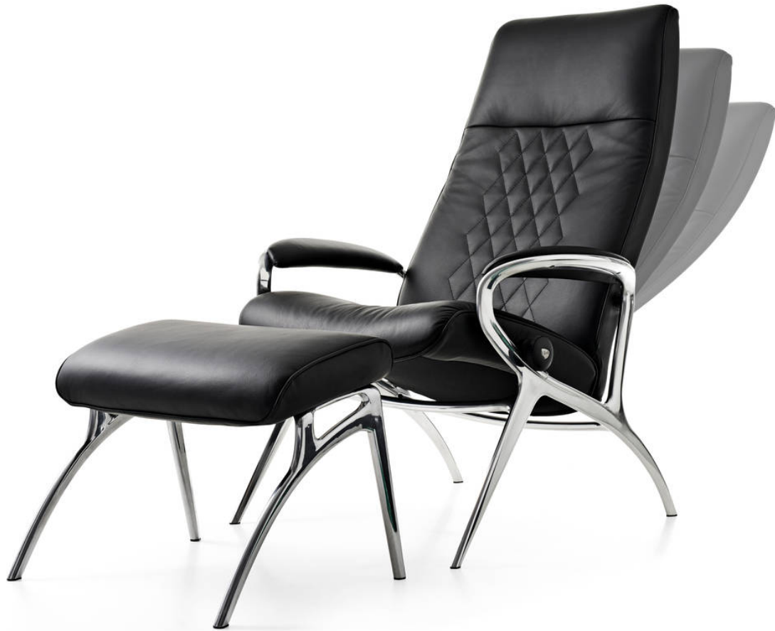
Stressless® YOU Michael aluminium