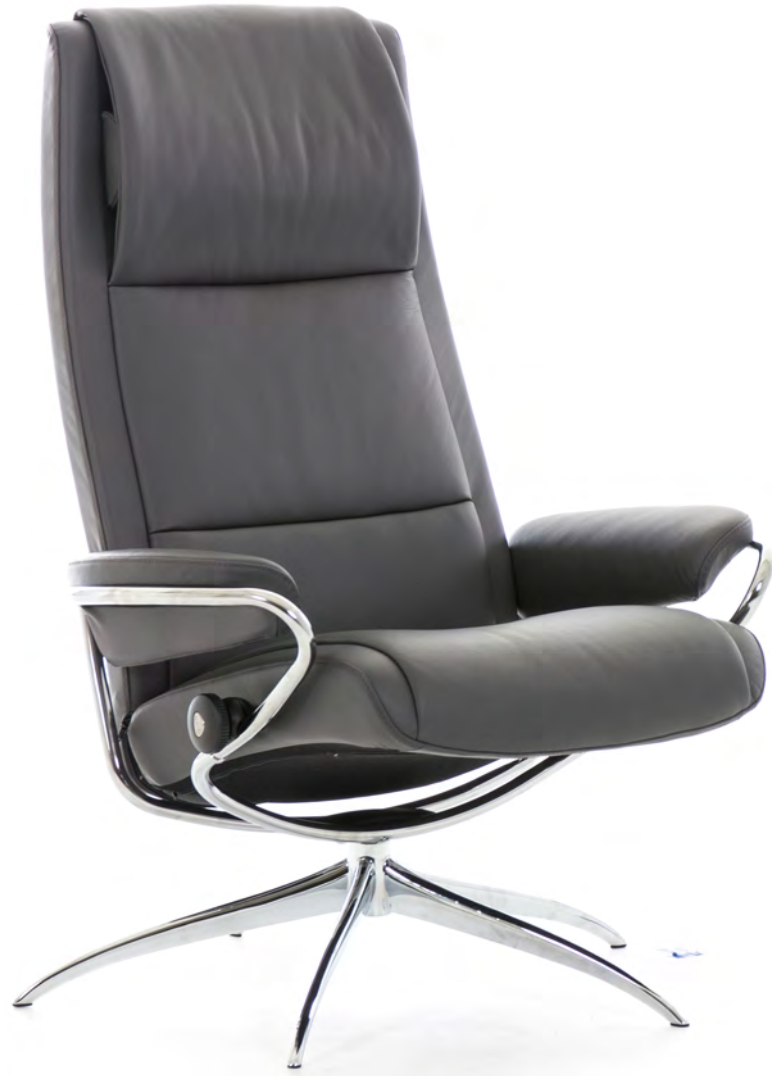
Stressless® Paris High Back