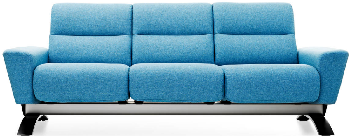
Stressless® YOU Julia three-seater