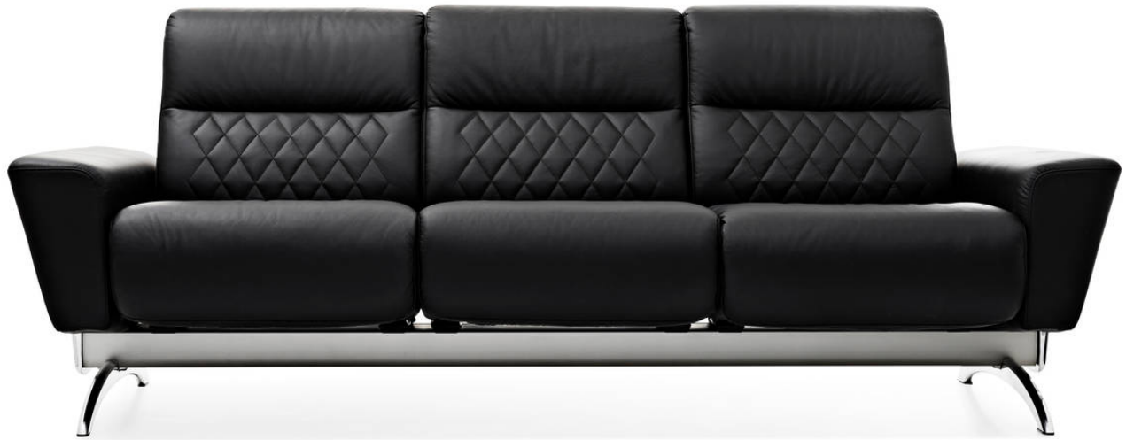
Stressless® YOU Michelle three-seater