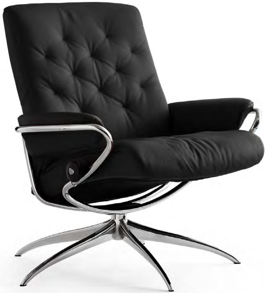
Stressless® Metro Low Back