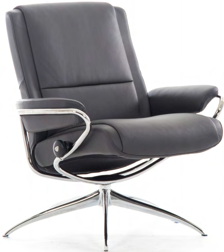
Stressless® Paris Low Back