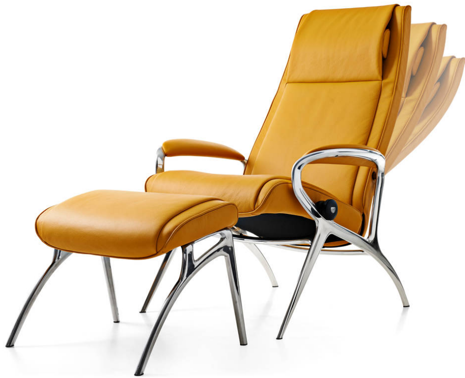
Stressless®YOU James aluminum