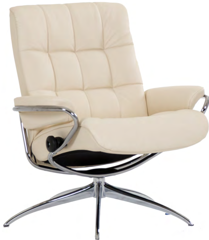
Stressless® London Low Back