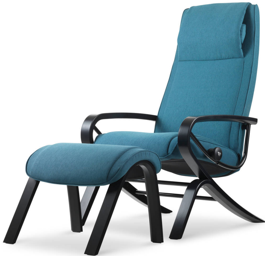
Stressless® YOU James wood