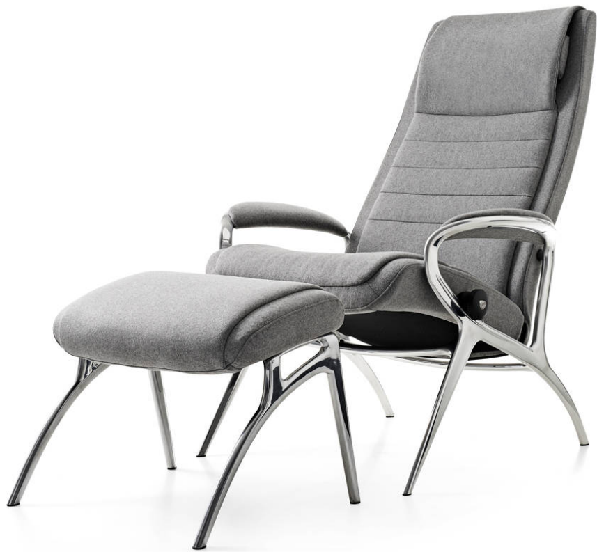
Stressless® YOU John aluminum