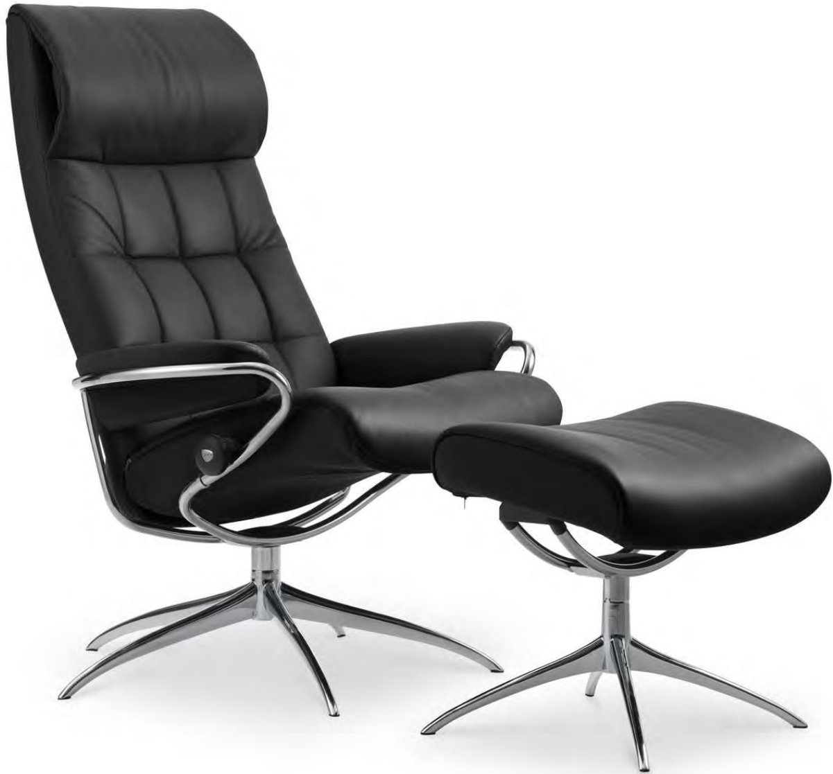
Stressless® London High Back