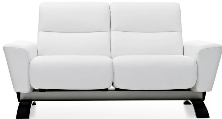
Stressless®YOU Julia two-seater