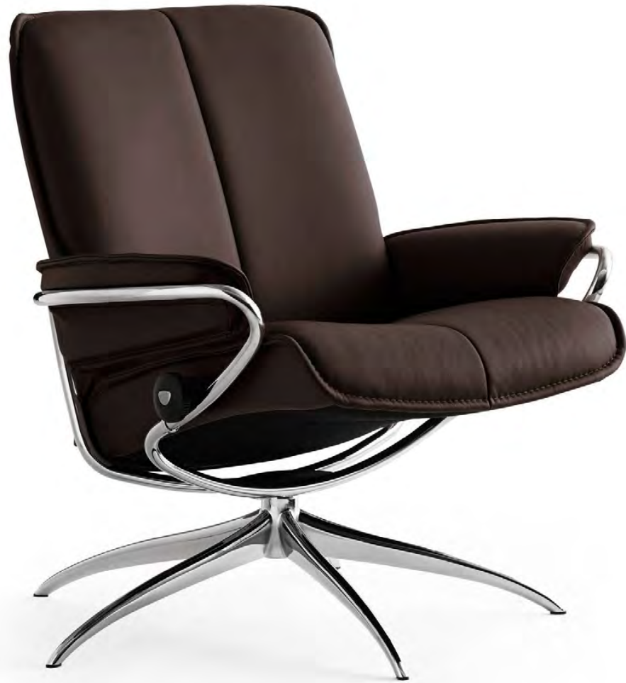
Stressless® City Low Back