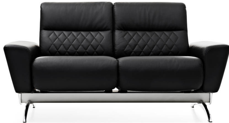
Stressless® YOU Michelle two-seater